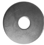
(11) 1 \frac{1}{4} in. washers for leveling legs